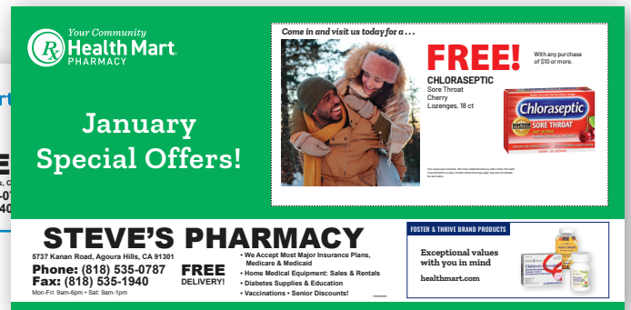
Size: 5.5" X 11"

**Consumer household data is HIPAA compliant and is compiled from opt-in health related questionnaires.